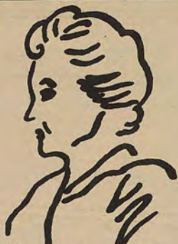
Women in History

At the time when she was in prison friends tried to persuade her to withhold her pamphlet "The Russian Revolution" from publication as being premature and possible harmful to the revolution, but she maintained that "honest criticism" was always in order. What does Rosa Luxemburg mean by "honest criticism" or "opposition to the regime"? She was