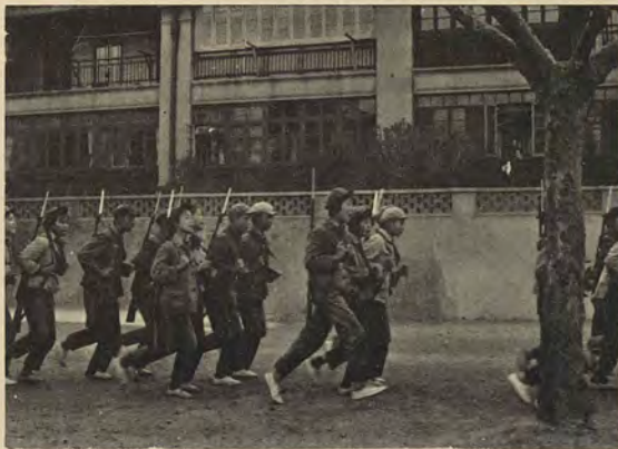
Youth Culture Palace of Hankow district in Shanghai — girls and boys doing military drill.

If we quickly survey some of the more common grounds for divorce in Canadian society, we find many result from incompatibility exploitation, frustration due to economic or job insecurity, sexual inadequacy, boredom or neurotic cultural male-female expectations and conjugal disappointment as, for example, the deterioration of superficial feminine beauty or the illusory notion of motherhood perpetrated by the media. Economic security, friendship and compatibility in marriage, working towards common goals and mutual respect all tend to produce a more stable and healthy marital institution in China.