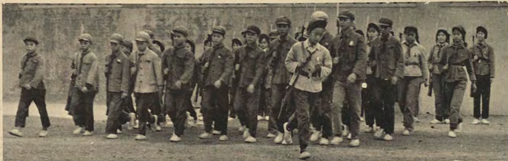
Little girl leading military drill at Youth Culture Palace in Shanghai.