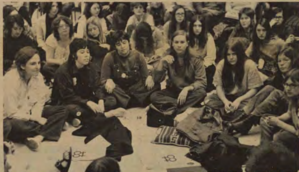
between the women's movements in the revolutionary societies of Vietnam and Laos and those in the 'advanced' capitalist societies of Canada and the US.

Throughout their talks they referred to their families with much feeling and concern and spoke of their longing to reunite with their families, most separated since 1954. Considering that the peoples of Indochina are largely peasants, it was understandable that they were amazed to find so many women in women's liberation rejected the family as a viable living pattern. They were also amazed that some women defined men as the enemy and could not work together with men.