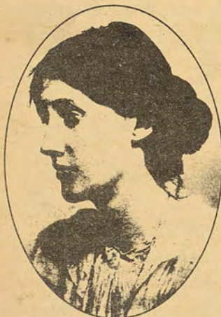
VIRGINIA WOOLF AT 21 The rising wave.