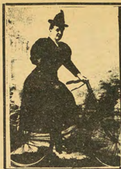
WOMEN'S LIBERATION ACROSS CANADA

AMAZON QUARTERLY 554 Valle Vista Oakland, Ca. 94610